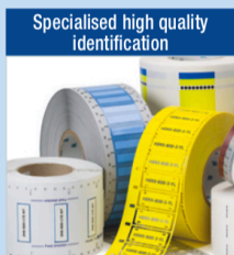
Specialised high quality identification