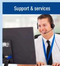
Support & services